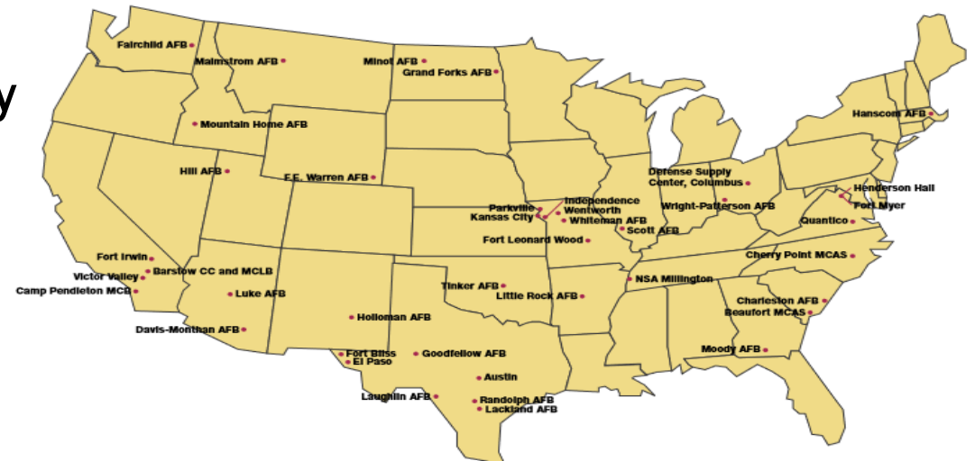
park university campus centers nationwide

Open admissions model outside of the flagship campus