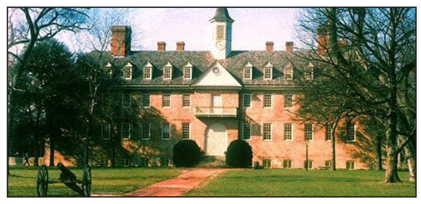
The College of William & Mary campus.