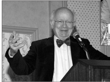
Luncheon speaker Professor Martin E. Marty