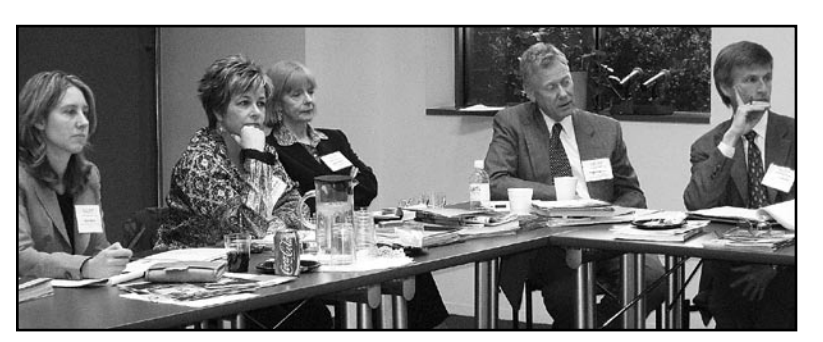
Seminar participants listen to briefings by federal agency officials.