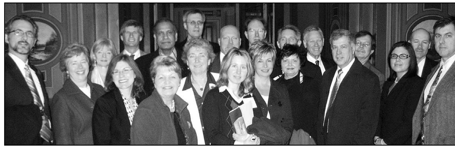
Participants from The Washington Seminar gather for a group photo outside the US Senate Appropriations Committee Room in the U.S. Capitol